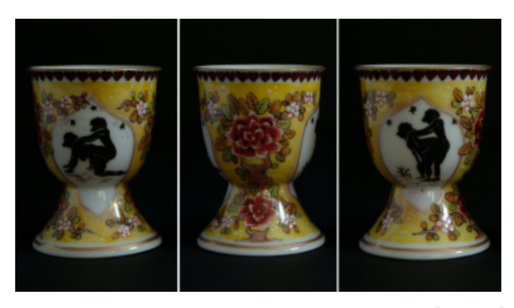
eggcups "egg swinger"