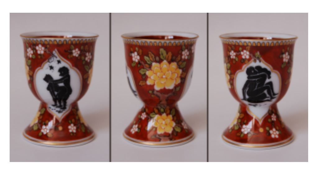
eggcups "egg swinger"