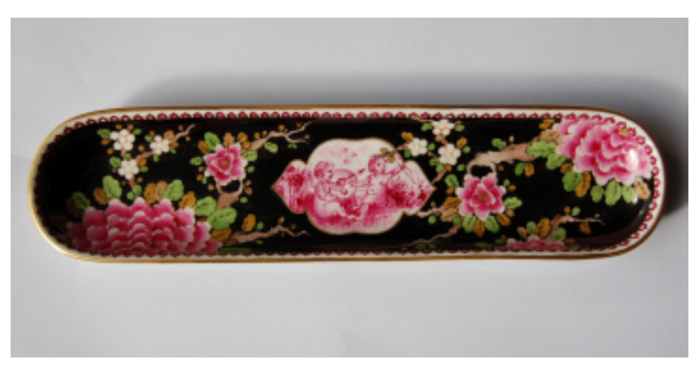
desk set "Amor's Arrow"