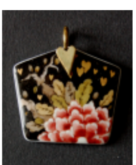
pendant with gilded catch