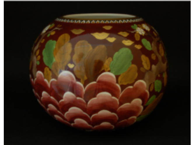
orbicular vase "femme"