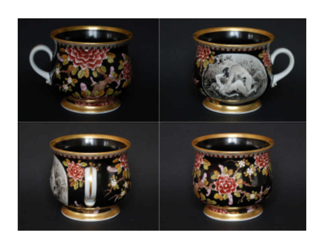
cup "Devilish Delight"