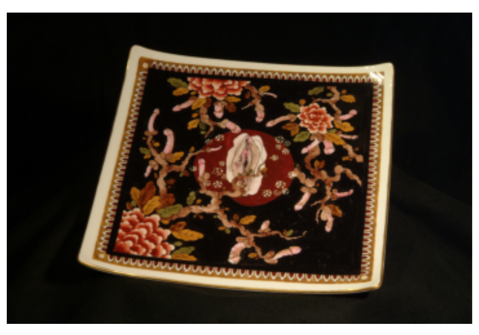
plate "Spring Awakening"